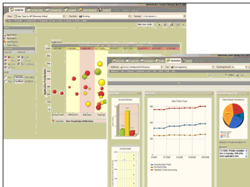
Figure 1. Graphical analysis provides a rapid evaluation and understanding of portfolio performance, speeds decision-making, and increases confidence in achieving strategic goals and value.

Primavera Portfolio Management features Investor Maps and dashboards to analyze key strategic decision-making data and metrics simultaneously. These essential metrics can also be used as the basis for “what if” scenario planning in Investor Maps to determine your optimal portfolio mix.