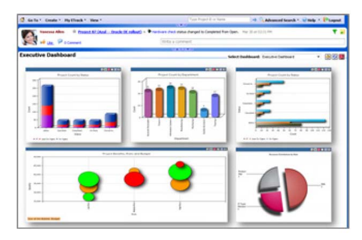
Figure 1. Dashboards aggregate and present key metrics in an intuitive fashion.