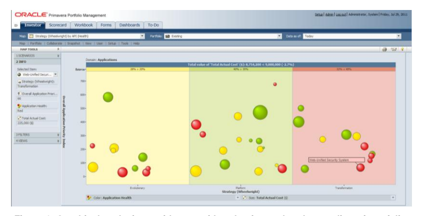
Figure 1. Graphical analysis provides a rapid evaluation and understanding of portfolio performance, speeds decision-making, and increases confidence in achieving strategic goals and value.

Primavera Portfolio Management features Investor Maps and dashboards to analyze key strategic decision-making data and metrics simultaneously. These essential metrics can also be used as the basis for "what if" scenarios planning in Investor Maps to determine your optimal portfolio mix.