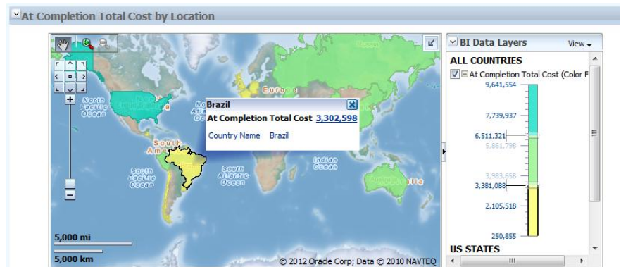
Figure 3. Geospatial maps allow project, cost, business process, resource and activity metrics to be visualized by geographic location with full drilldown capabilities.

Primavera Analytics will give your entire organization a single BI solution where published project performance indicators, trends, statistics, graphs and geospatial maps are available through a self-service portal. With the flexibility of the Oracle BI engine, you can combine your project data from your instances of Primavera Unifier and Primavera P6 EPPM with information from your ERP systems, financial data, or customer data to create a single view of the truth across the enterprise. This provides an increased level of transparency and visibility into your business processes and project performance that are required to maximize efficiencies and return on investment.