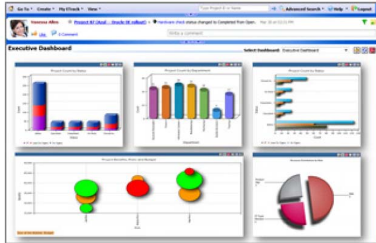
Figure 2. Dashboards aggregate and present key metrics in an intuitive fashion.

The heart of Instantis EnterpriseTrack is its market-leading dashboard and reporting capabilities. They allow easy, secure, instant dashboard and report creation and sharing with full drill-down capability. Dashboards and reports can be configured to securely roll up and report on project resources, progress, costs, and results in and across project portfolio types, making it an ideal solution for supporting enterprise project management offices (PMOs).