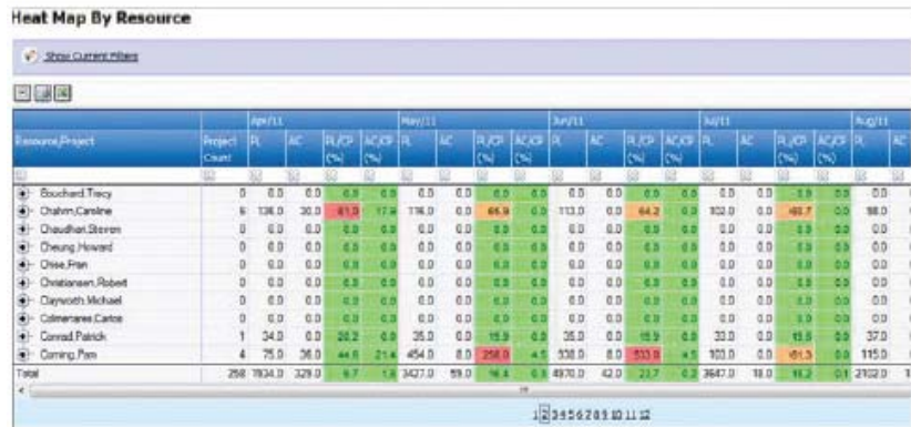
Figure 1. Gain instant visibility to availability by resource or role with heat map reports.

The following screen shots highlight key resource and capacity management capabilities including resource availability/utilization heat maps, what-if scenario planning, and graphical resource utilization reporting.