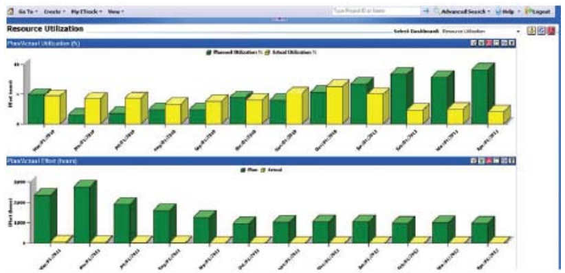
Figure 3. Report on resource utilization, strategy alignment, and other key metrics.