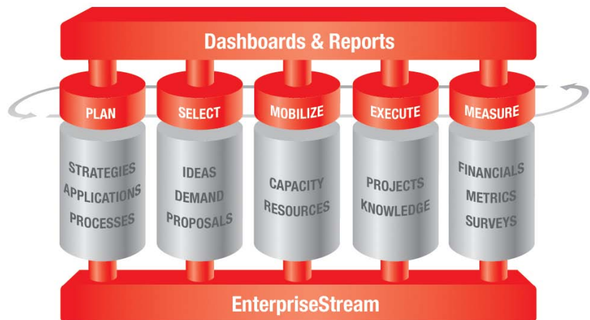
Figure 1. Overview of Instantis EnterpriseTrack with the EnterpriseStream module providing communication and collaboration for all phases of the PPM lifecycle.

A fully integrated module of Oracle's market-leading Instantis EnterpriseTrack enterprise PPM system, EnterpriseStream is the first and only purpose-built and seamless collaboration and social networking capability for project portfolio management (PPM) practitioners and stakeholders across the enterprise. This contrasts sharply with competitive alternatives that depend on a third-party general-purpose enterprise social networking platform.