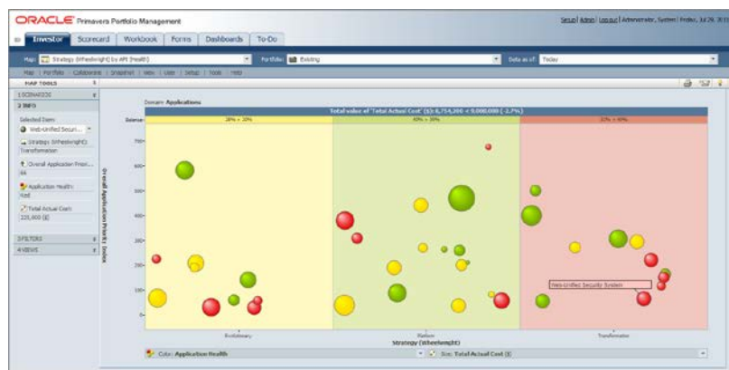
Figure 1. Graphical analysis provides a rapid evaluation and understanding of portfolio performance, speeds decision-making, and increases confidence in achieving strategic goals and value.

Primavera Portfolio Management features Investor Maps and dashboards to analyze key strategic decision-making data and metrics simultaneously. These essential metrics can also be used as the basis for “what if” scenarios planning in Investor Maps to determine your optimal portfolio mix.