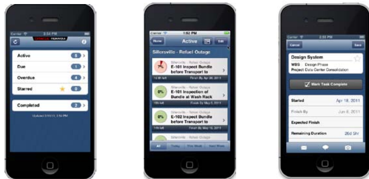
Figure 1. The P6 Team Member application enables users to easily make updates to their assigned tasks and send emails or discussions to update the project manager or other team members on the current status of the project from their iPhone.