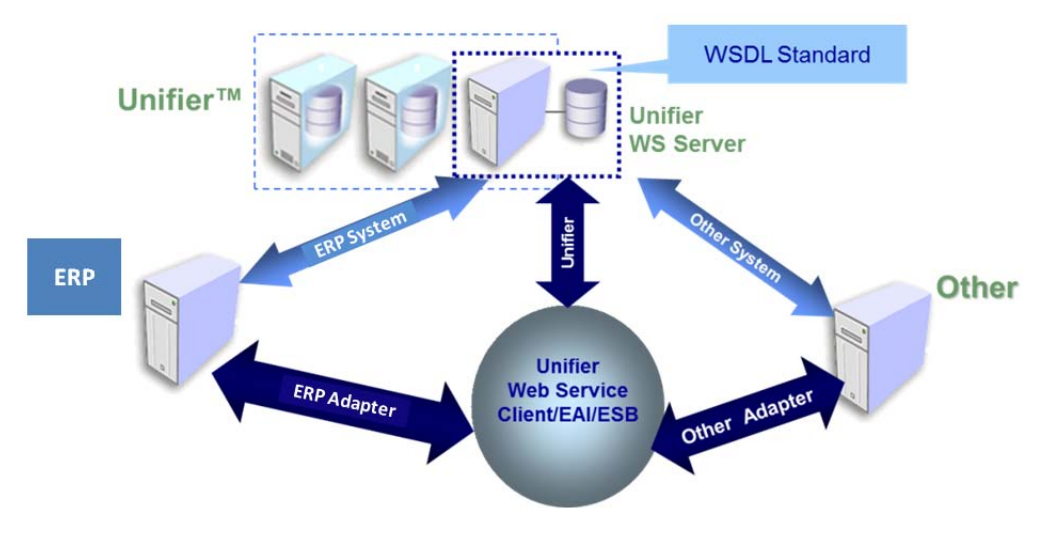
Figure 2. Web services architecture